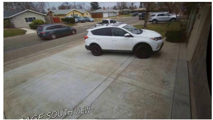
Figure 2: Video motion tracking of V-2

The location of V-2 on approach to and into the intersection was determined by tracking its travel through the field of view of one of the surveillance cameras. Figure 2 shows the tracked position in an idealized still frame from one of the available surveillance videos. V-1 was visible in the surveillance video for less than 2 seconds. V-1 could be seen traveling behind V-2 in the middle of this 2 second interval as shown in Figure 3.