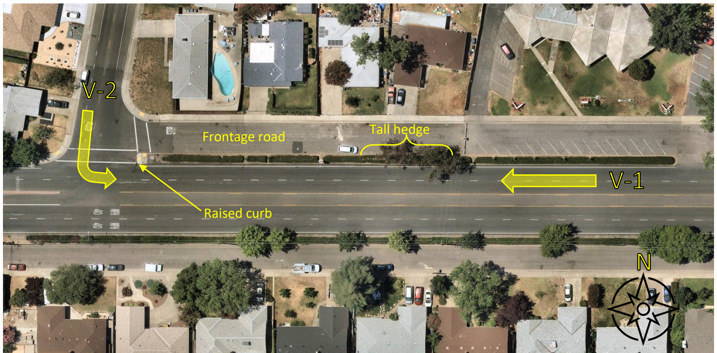
Figure 1: Incident location

The incident described in this case study occurred in Rancho Cordova, California, in 2020. An overview of the incident location is shown in Figure 1. A 2017 Kia Optima (V-1) was traveling westbound on an arterial roadway at more than twice the speed limit. Party Two (P-2), driving a 2012 Honda Odyssey (V-2), was departing his residential neighborhood and initiated a left turn onto the arterial roadway after slowing his vehicle to a near stop for a posted stop sign. A tall hedge with interspersed trees was planted between the arterial roadway and a frontage roadway between 200 and 280