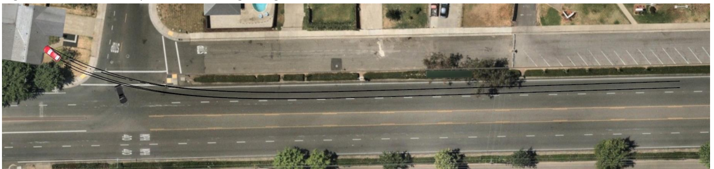
Figure 6: Simulated Kia path of travel beginning in the number two lane