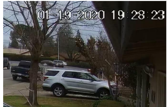
Figure 3: Near collision of Kia with stopped Honda

The Kia EDR data showed that P-1 was driving at more than 82 miles per hour and accelerating five seconds prior to the collision, on a roadway with a 40 miles per hour speed limit. Analysis of the Kia EDR data indicated that P-1 had initiated right steering approximately 1 second before the Kia became visible in the surveillance video. To determine the initial lane of travel of V-1, HVE/SIMON simulations were performed utilizing the EDR data obtained from V-1. A 3D model of the roadway was created from scene scan data. The Vehiclemetrics model of the 2021-2022 Kia K5 LXS was used as the starting point for the SIMON model for V-1. Minor dimensional and inertial changes were made to the K5 model to match published specifications for the 2017 Kia Optima. The K5 drivetrain properties were also modified to match the Optima. The steering ratio of the Optima model was adjusted to produce a minimum diameter turning circle that matched specifications.